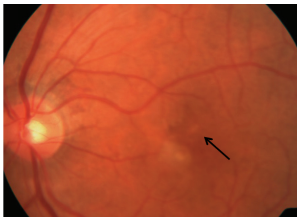
Figure 2 Wet AMD. Choroidal neovascularization (indicated by arrow).

In wet AMD, there is a sudden or gradual decrease in visual acuity, blind spots in the center of vision, and distortion of straight lines. The hallmark of wet AMD is choroidal neovascularization (CNV) ( Figure 2 ).